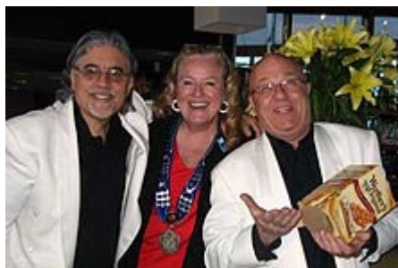
Over 70 Ontario Skålleagues and guests met on Apr. 22